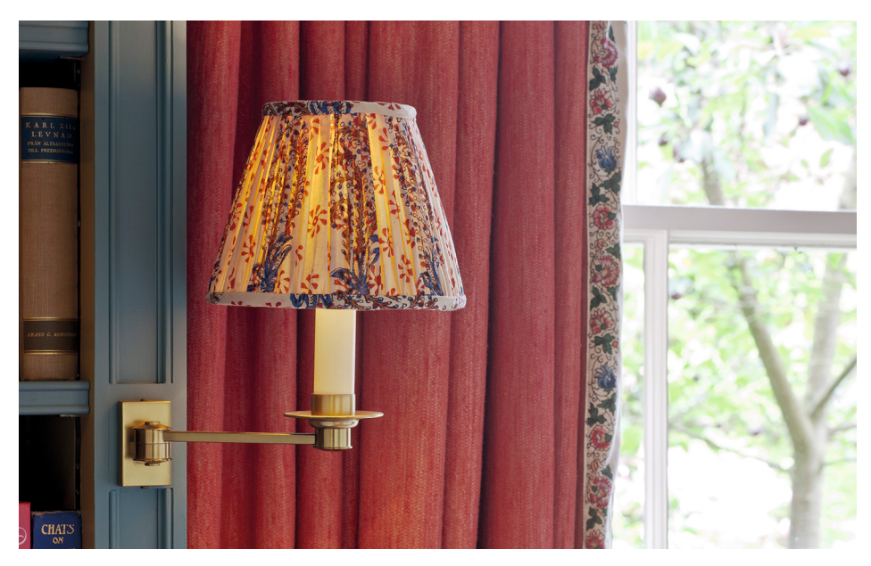
Each lampshade is selectively handmade, with limited runs of fabric, to ensure you are met with a unique and timeless piece of craftsmanship.