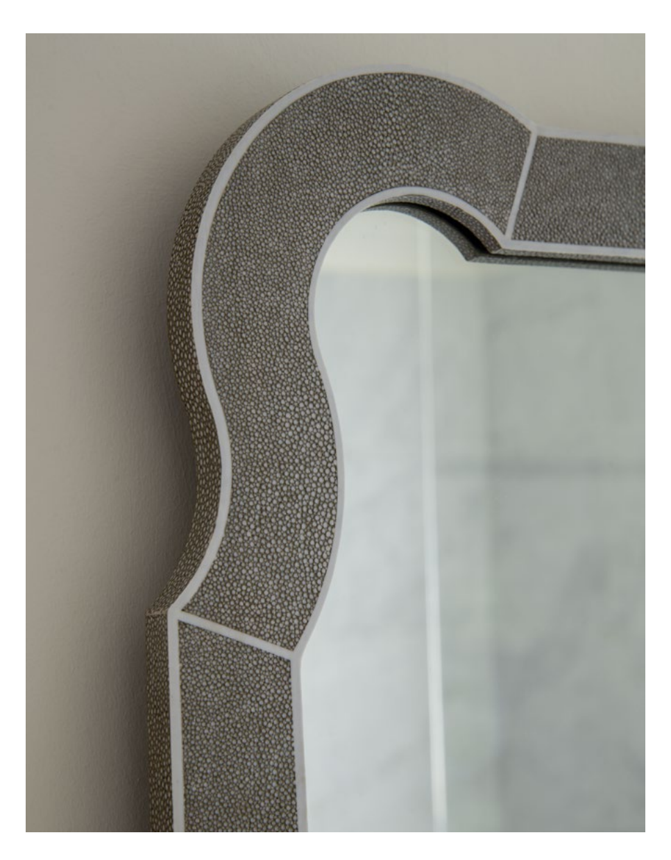
SAVOY MIRROR FM0054.TAS

Based on an early 18th century design, this mirror is elegant in form and given a contemporary flair thanks to the use of faux shagreen. It is finished with a white decorative line applied around the frame.