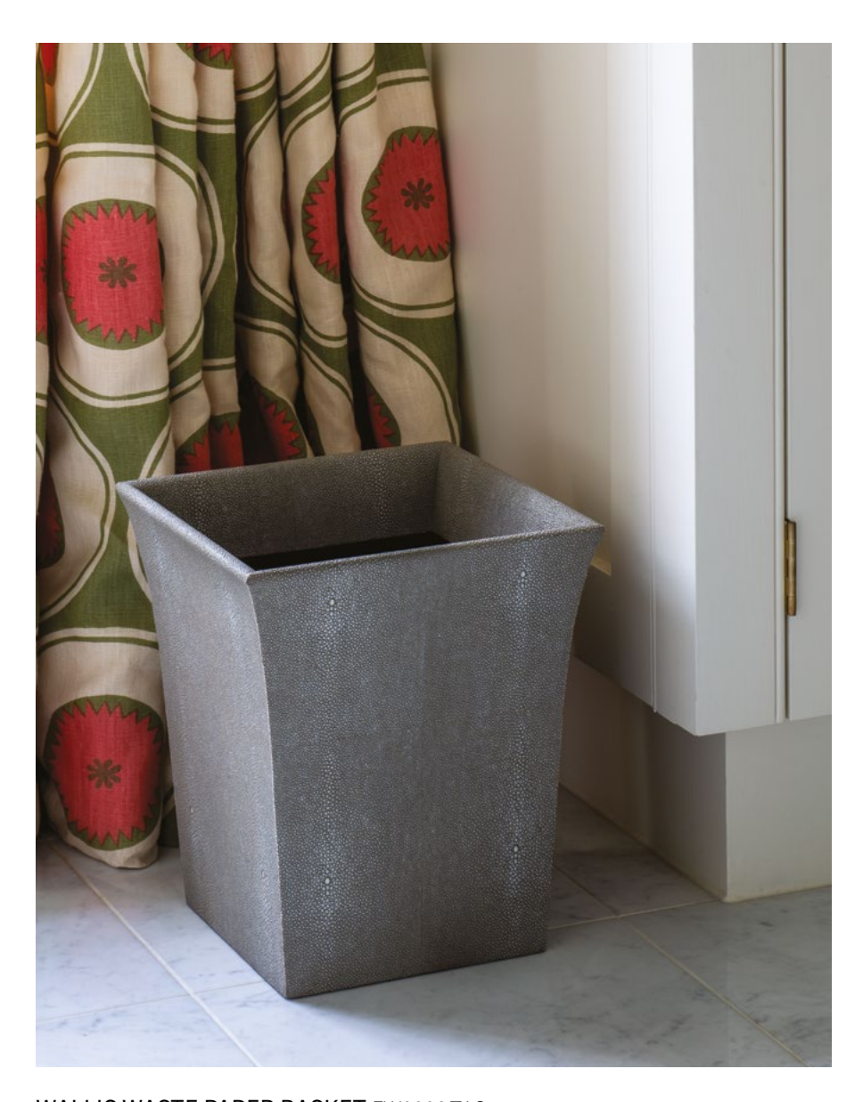
WALLIS WASTE PAPER BASKET FW0008.TAS

Inspired by an antique design, this taupe faux shagreen waste paper basket has a fluid, tapered line and comes with the practical component of a removeable inner liner.