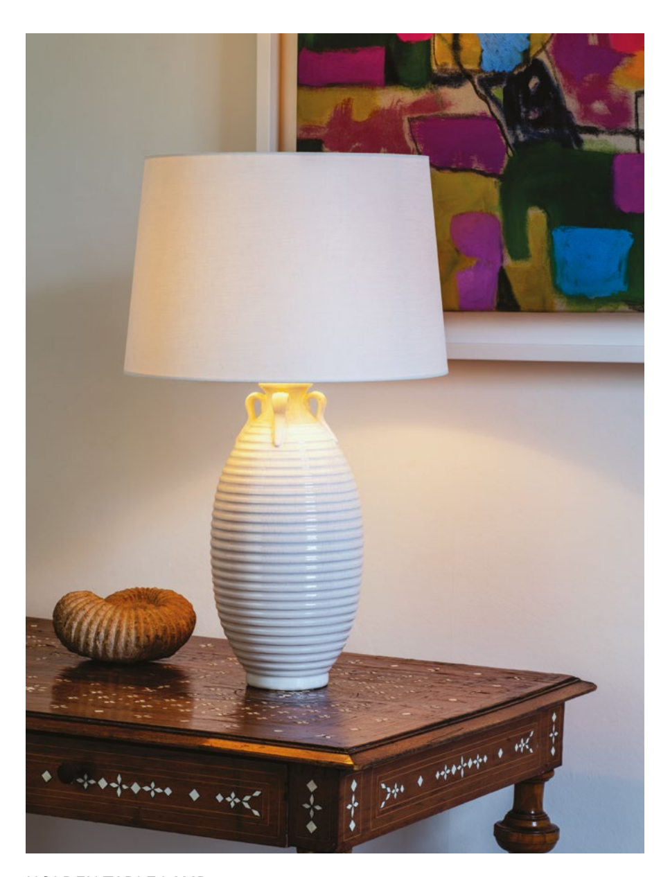
HOLDEN TABLE LAMP TC0125

Inspired by ancient Greek and Roman olive jars, this vase has a soothing curved form. It is given a simple yet sophisticated finish with distinctive etched lines and a lightly crackled surface.