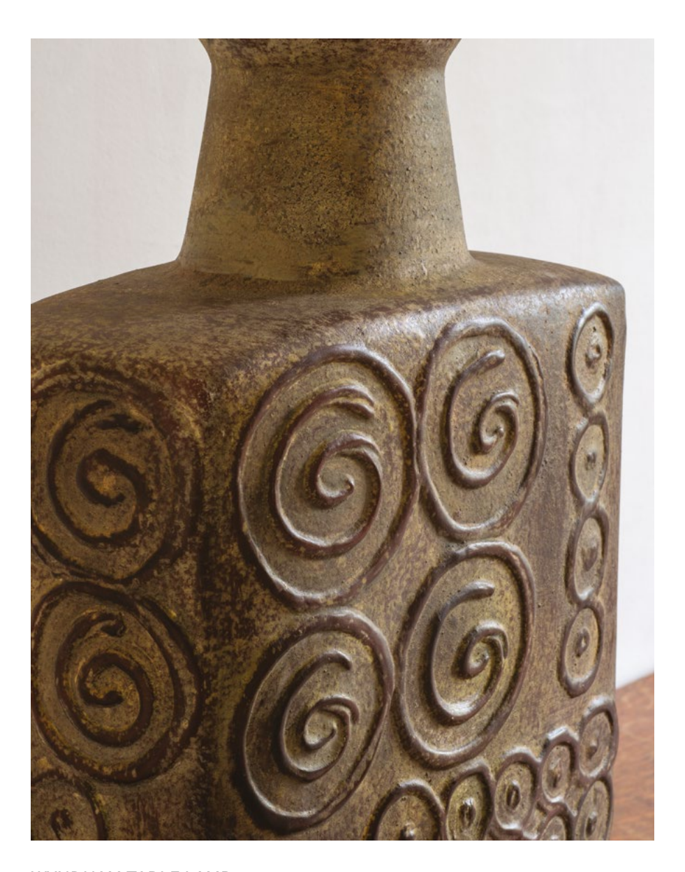
WYNDHAM TABLE LAMP TC0124

Based on an early 20th century original, this vase is decorated with flowing swirl motifs to give it a wonderful textured feel. The non-uniform colour adds a sophisticated element to the aesthetic. The bas relief harks back to Greek, Roman and other ancient civilizations.