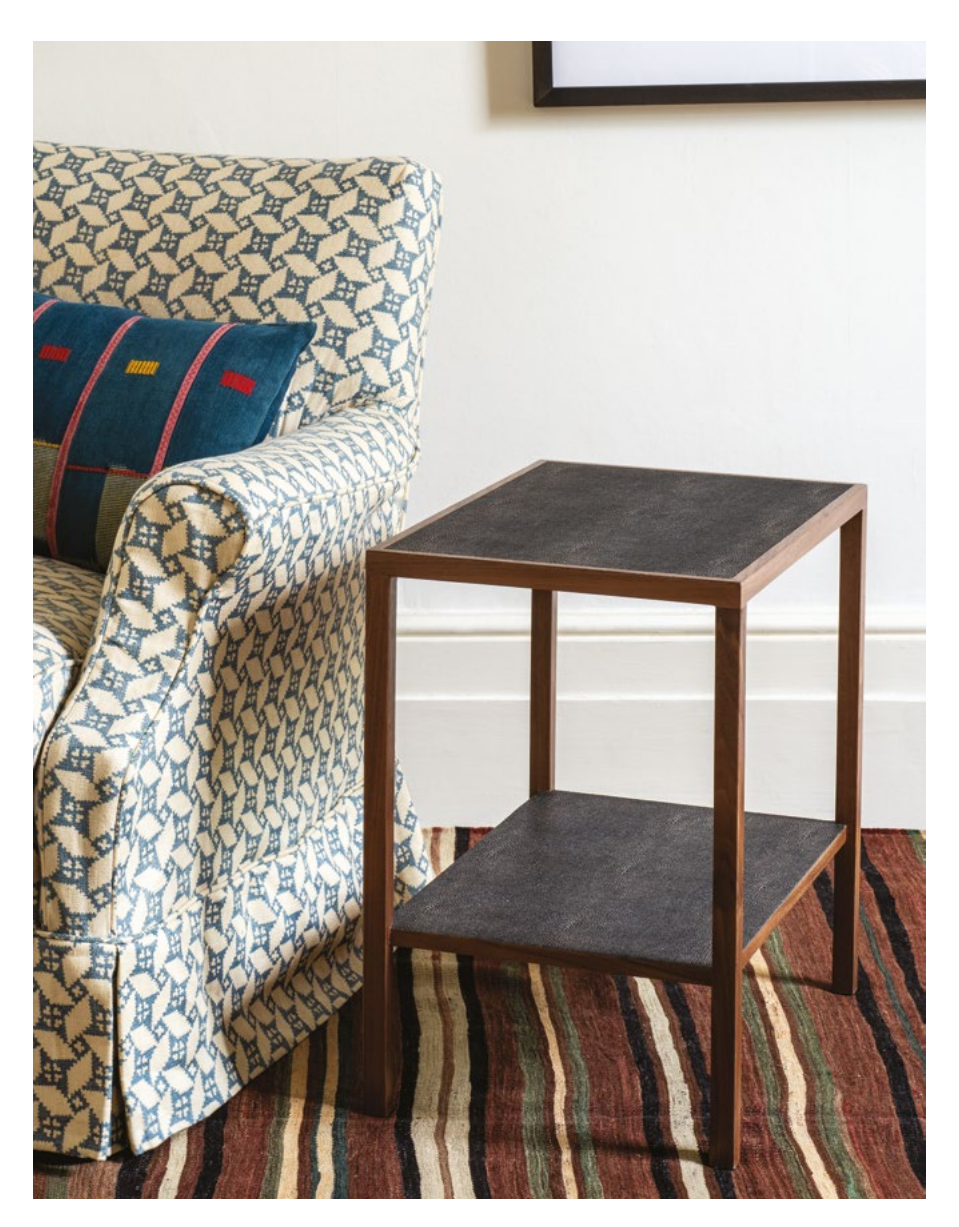
PIMLICO ETAGERE FT0114.BRS & FT0115.BRS

A delightful combination of wood and shagreen, the design for this etagere came from an original antique. Available in two sizes, the wood neatly frames the brown faux shagreen, giving a decidedly contemporary feel to a more classic design.