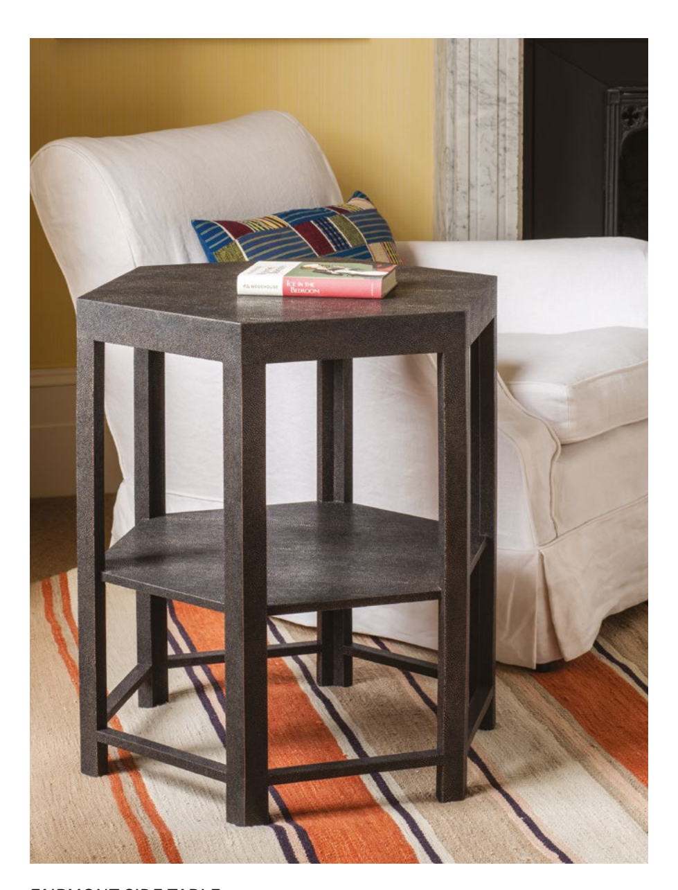
FAIRMONT SIDE TABLE FT0113.BRS & FT0113.TAS

A neat and satisfying design, this side table has a classic hexagonal shape to it, which is given a contemporary twist thanks to the addition of faux shagreen. Available in either taupe or brown.