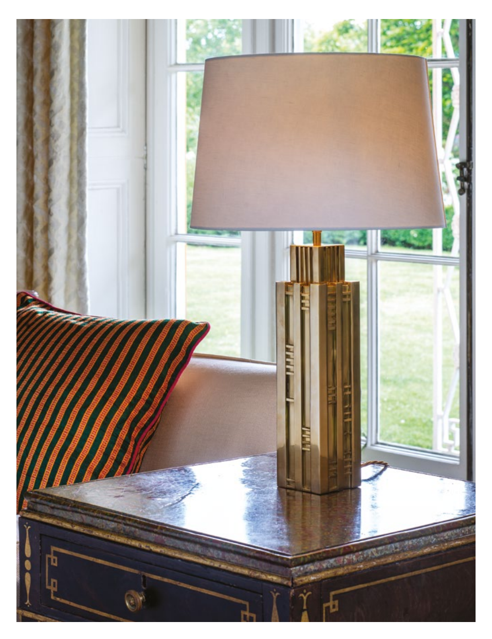
HUDSON TABLE LAMP TM0100.BR

A contemporary shape, reminiscent of American skyscrapers, this table lamp has a crisp line to it. The profile and applied decoration have an affinity to Axumite obelisks from 4th century Ethiopia.